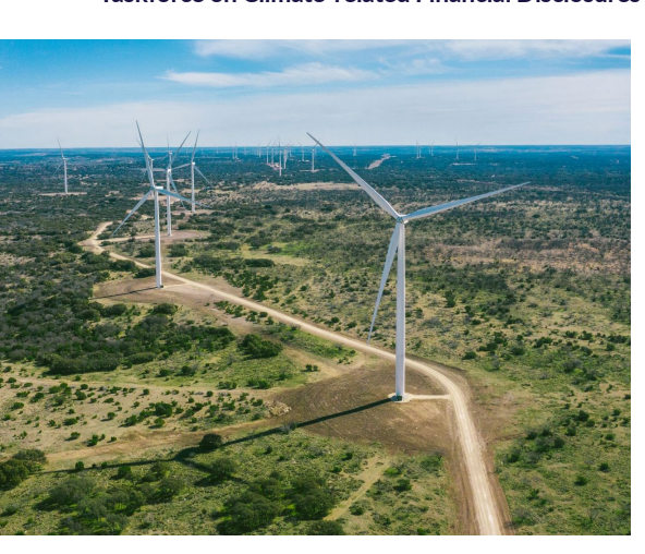
/ Live Oak Wind Farm. US.