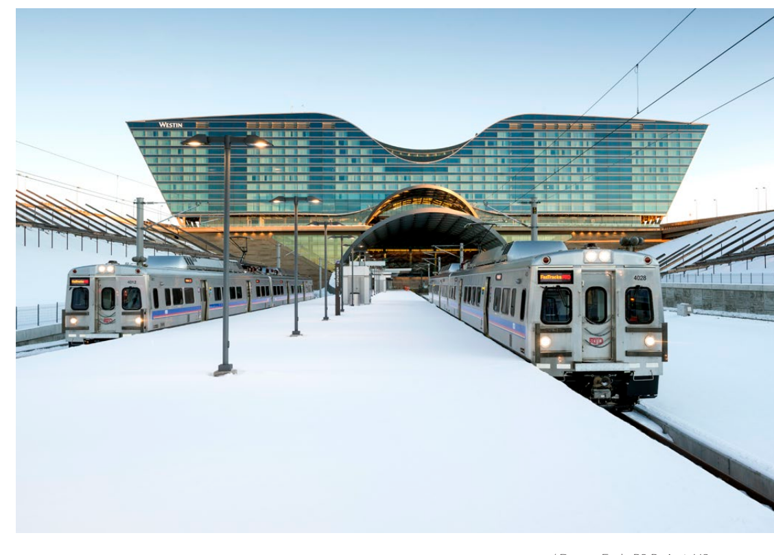
/ Denver Eagle P3 Project, US.