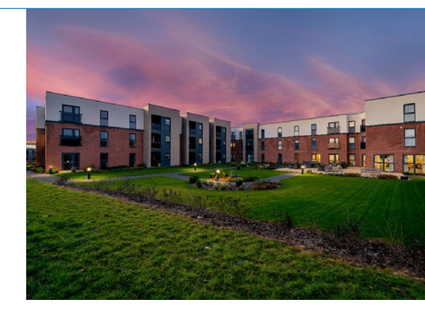
/ Brigid Investments Limited, a UK-based retirement accommodation business.

In an increasingly digital world, we seek to ensure information security / data protection across all our business, projects and operations.